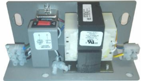
Old Power Supply P.N. A-00029 (14-11741)

Incoming power will now be connected using pigtail wires from the power supply assembly rather than a terminal strip, otherwise there is no change to the installation/service process. 1175 manuals will be updated to show this soon.