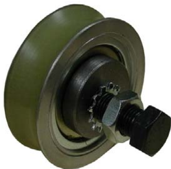
Old Style Roller